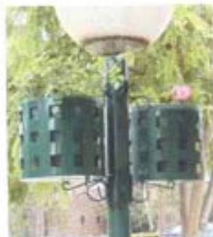
5213 Post/wall mounted