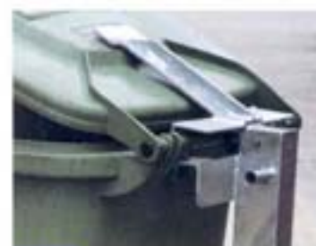
3225 Security Clamp

Automatic locking security clamp to suit 80/120/140/240 litre wheel bins. Supplied in single or double bin configuration on posts for in-ground or bolt down (base plated) installation. Unique design allows for wall mounting as well. Standard finish: hot dipped galvanised.