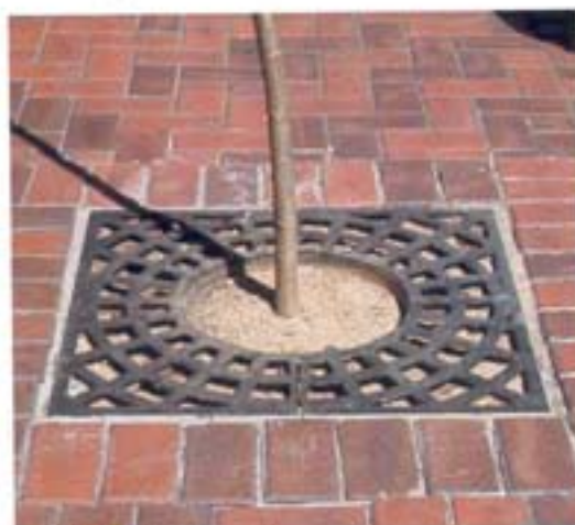
9439 Classic style

Utilising the precision of laser cutting technology, we can design and manufacture tree grates in almost any shape, size or pattern imaginable. Strength and durability are assured by using mild steel which is hot dipped galvanised and coated in bitumen paint after fabrication. All tree grates can be supplied as either two or four part units and come complete with a frame.