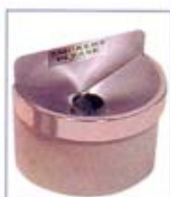
9500 Ash tray