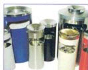
Ash tray waste bins