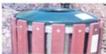
3060 Optional domed cover