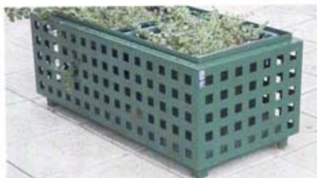
5209 Free standing

Tree guards are a practical and stylish way to protect trees from animals and vandalism. Manufactured in mild steel and then hot dipped galvanised and powder coated, the tree guards can be customised to your streetscape colour scheme. Designs to match existing street furniture or fabrication of a brand new style are also part of the service. The examples shown above are just some of the many designs