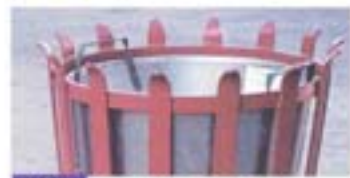
3079 Decorative steel slats