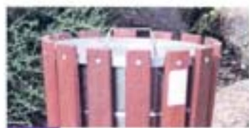
3061 Tapered timber slats