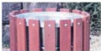
3065 Parallel timber slats