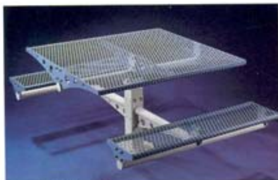
MET J Metropolis