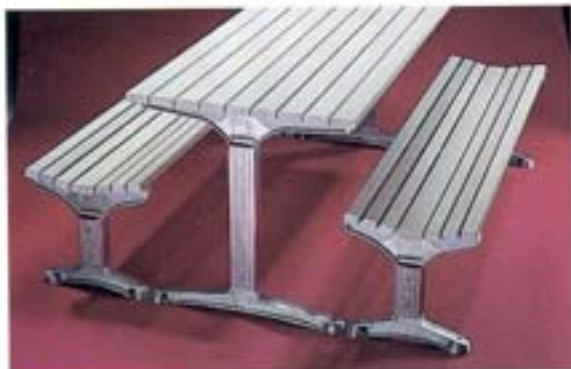
MIL R Millennium