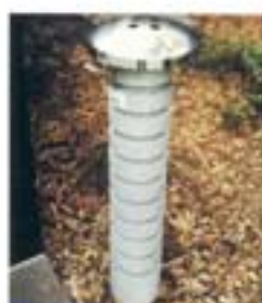
9334 Butt Bin